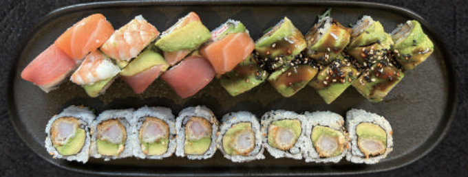
18 Maki luksus box / 40stk 390,- 8 rainbow, 8 green ebi, 8 Miami, 8 crispy ebi, 8 san francisco.