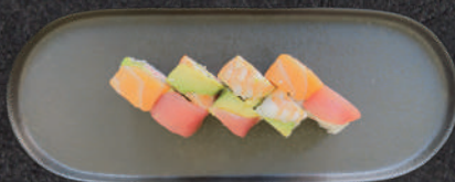
65 Super rainbow 130,- (super California ,toppet med laks,tun,reje,avocado)