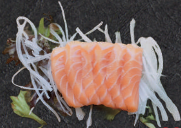
28 Laks sashimi 6stk 90,-