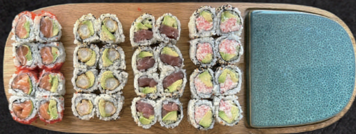
15 Maki box / 32stk 260,- 8 Spicy laks, 8 Spicy tun, 8 California, 8 crispy ebi.