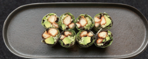
34 Kylling 85,- (stegt kylling, mixsalat, avocado, agurk, goma dressing)