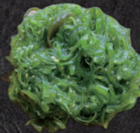
3 Tangsalat (seaweed salad) 40,-