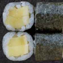
42 Mango 40,-