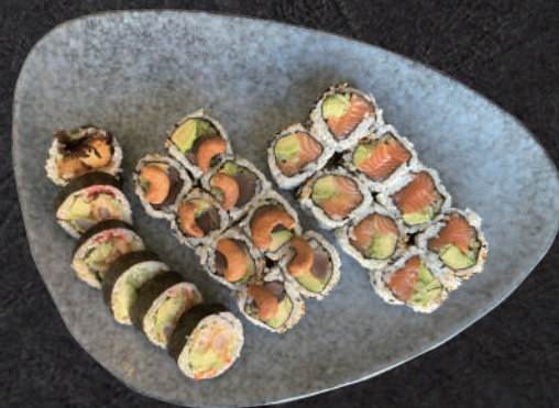
14 Maki box / 22stk 190,- 8 spicy laks, 8 Miami, 6 Big crispy ebi