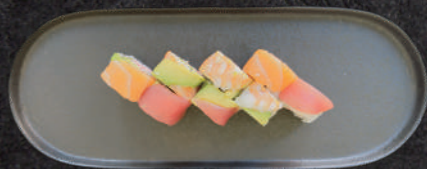
64 Rainbow 110,- (California ruller toppet med laks, tun, reje, avocado)