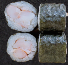
43 Rejer 40,-