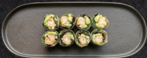
33 Crispy ebi 85,- (Tempura reje , mixsalat, avocado, agurk, chili mayo)