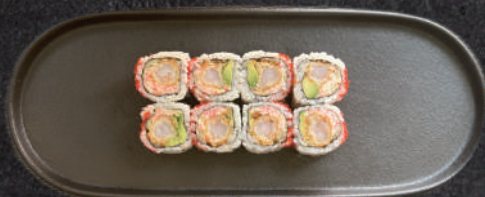
56 Kaiseki Crispy ebi 85,- ( Tempura reje , snowcrab, avocado, agurk, tobiko, teriyaki)