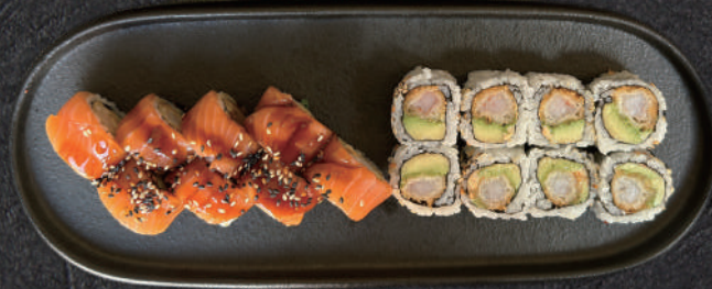
17 Maki luksus box / 32stk 290,- 8 Miami, 8 crispy ebi, 8 philly laks, 8 Sparkling salmon.