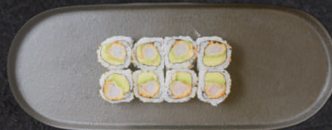
55 Crispy ebi 75,- ( Tempura reje, avocado, agurk, tobiko, chili mayo, teriyaki)