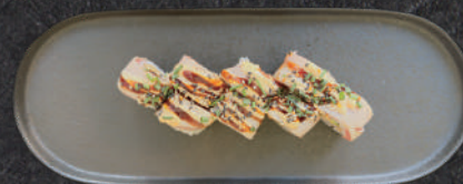
66 Orange ebi 125,- (Crispy ebi ruller toppet med flamberet laks, chili mayo, teriyaki, forårsløg)