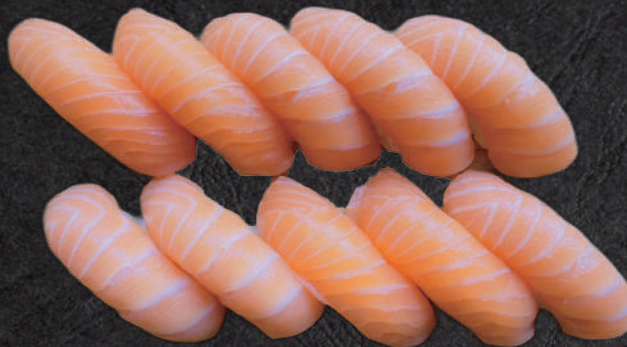
82 Nigiri box lille 180,- ( 10 stk laks nigiri)