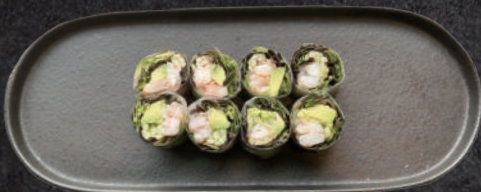
37 Tigerreje 85,- (tigerreje , mixsalat, avocado, agurk , chili mayo)