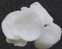
7 Reje chips 25,-