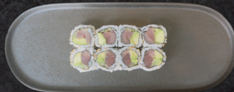
53 Spicy tun 75,- ( tun, avocado, agurk, chili mayo, sesam)