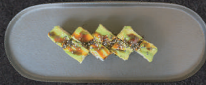
68 Geen laks 120,- ( laks, agurk , toppet med avocado, chili mayo, teriyaki, sesam)