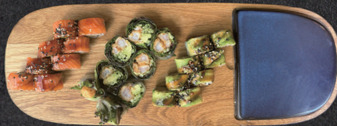
16 Crisy box / 24stk 270,- 8 Green ebi, 8 Sparkling laks, 8 rispaper med crispy ebi.