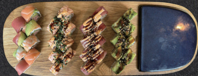
20 Dragon mix / 32stk 410,- 8 rainbow, 8 green ebi, 8 Sparkling tuna, 8 orange ebi.