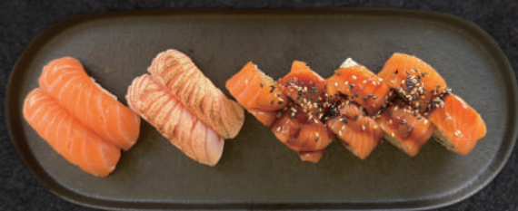
10 Laks box / 12stk 170,- 8 Sparkling laks. Nigiri: 2 laks, 2 flamberet laks.