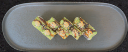
61 Green ebi 110,- (Crispy ebi ruller toppet med avocado, chili mayo, teriyaki, sesam)