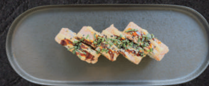
71 Kaiseki dragon 130,- ( snekrabbe, Tempura reje ,avocado, toppet med flamber laks , chili mayo,teriyaki,forårsløg)