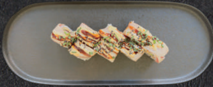
67 Oslo 125,- ( Crispy ebi ruller toppet med flamberet tun, chili mayo, teriyaki,forårsløg )