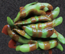
2 Spicy edamame bønner 40,-