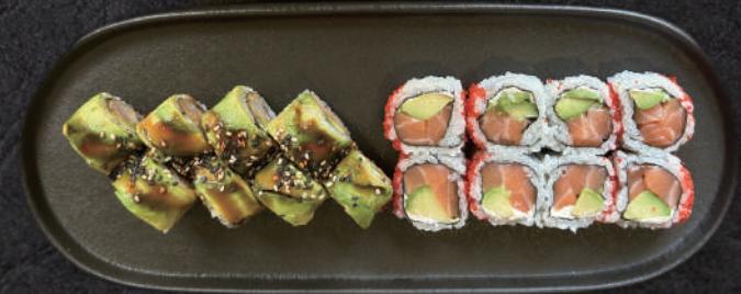
22 Gourmet box / 24stk 300,- 8 green laks, 8 alaska, Nigiri : 2 laks, 2 tun ,2 rejer ,2 flamber laks.