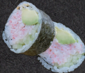
46 Big California 60,- ( surimikrabbe, avocado, agurk, sesam)