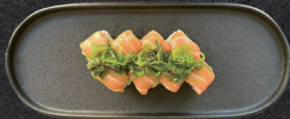
70 Sunshine 120,- ( California toppet med laks, chili mayo, sesam, tangsalat )