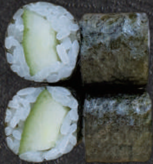
38 Agurk 35,-