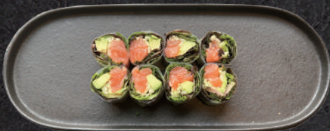
35 Laks 85,- (laks, mixsalat, avocado, agurk, goma dressing)