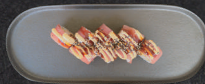
63 Sparkling tun 120,- (Crispy ebi ruller toppet med tun, chili mayo teriyaki, sesam)