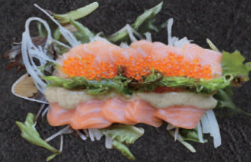
29 Laks ceviche 6stk 95,- ( laks, tangsalat, lakserogn, goma dressing )