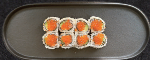
54 San Francisco 85,- ( laks, avocado , agurk, basilikum, sesam, lakserogn )