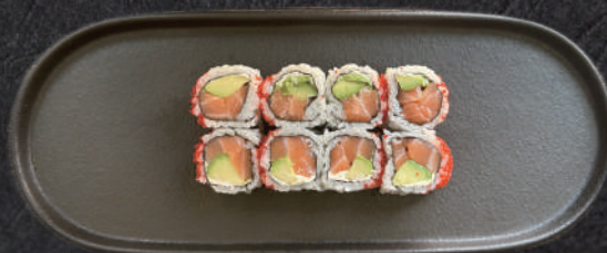
60 Alaska 80,- ( laks, avocado, flødeost, tobiko)