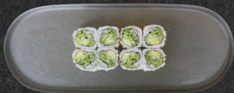
48 Vegetar 70,- ( tangsalat, tofu, avocado, agurk ,