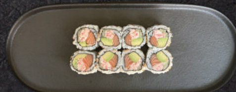
51 New Jersey 75,- ( surimikrabbe , laks, avocado, agurk, sesam)