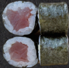
41 Tun 40,-