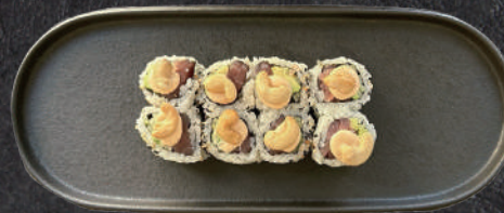
57 Miami 75,- ( tun, avocado, agurk, chili mayo, cashnødder,sesam, teriyaki)