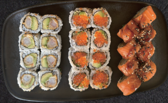
23 Gourmet box / 36stk 400,- 8 crispy ebi, 8 Sparkling laks, 8 san francisco, Nigiri :3 laks, 3 rejer ,3 tun ,3 flamber laks.