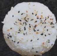
8 Sushi ris 20,-