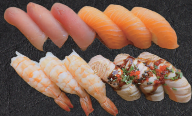
83 Nigiri box stor 200,- ( 3 laks , 3 flamberet laks, 3 reje, 3 tun)