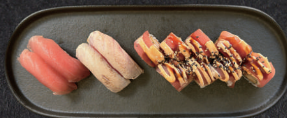
11 Tun box / 12stk 170,- 8 Sparkling tun. Nigiri : 2 tun, 2 flamberet tun.