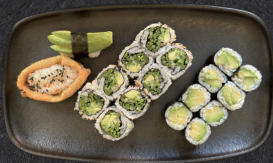
13 vegetar box / 18stk 128,- 8 vegetar, 8 hoso avocado, Nigiri: 1 tofu, 1 avocado.