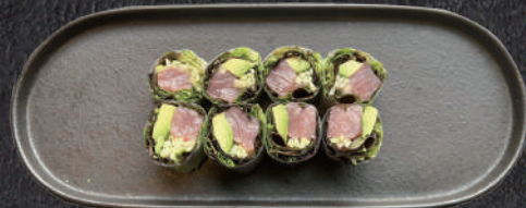
36 Tun 85,- (tun, mixsalat, avocado, agurk, goma dressing)