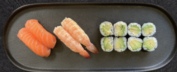
12 Børne box / 12stk 85,- 8 Hosomaki med agur & avocado Nigiri: 2 laks ,2 rejer.