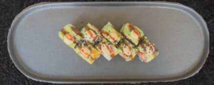
69 Green tun 125,- ( tun, agurk, toppet med avocado, chili mayo, teriyaki, sesam)