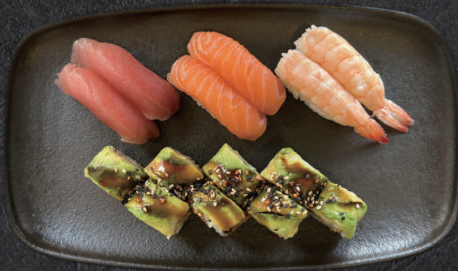
21 Gourmet box / 14stk 190,- 8 green ebi, Nigiri : 2 laks, 2 tun, 2 rejer.