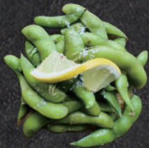
1 Edamame bønner 35,-