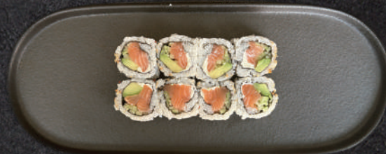
59 Philly laks 75,- ( laks, flødeost, avocado, agurk, sesam)