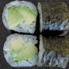
39 Avocado 35,-