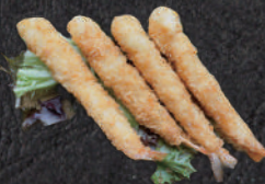
5 Tempura reje 4stk 55,-