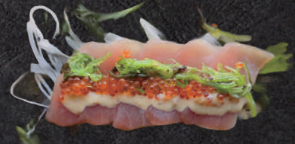
31 Tun ceviche 6stk 100,- ( tun, tangsalat, lakserogn, goma dressing )