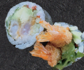
47 Big Crispy ebi 65,- ( Tempura reje, salat, avocado, agurk, tobiko, chili mayo, teriyaki,forårsløg )