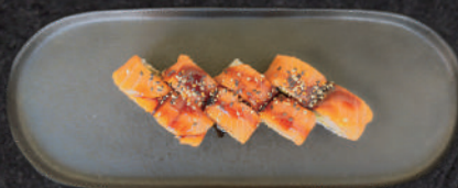
62 Sparkling laks 120,- (Crispy ebi ruller toppet med laks, chili mayo, teriyaki, sesam)