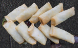
4 Mini forårsruller (vegetar) 10stk 50,-