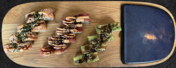
19 Dragon mix / 24stk 310,- 8 green ebi, 8 Sparkling tuna, 8 orange ebi.