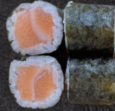
40 Laks 40,-