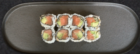
52 Spicy laks 75,- (laks, avocado, agurk, chili mayo , sesam)