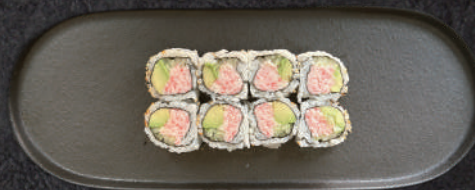
49 Super california 85,- ( snekrabbe, tobiko, avocado, agurk)