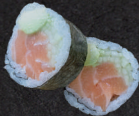
44 Big Spicy laks 65,- ( laks, avocado, agurk, sesam, chili mayo)