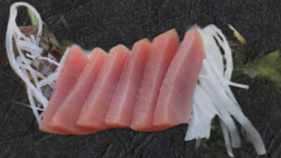
30 Tun sashimi 6stk 95,-