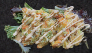
9 kakiyaki 4stk 40,-