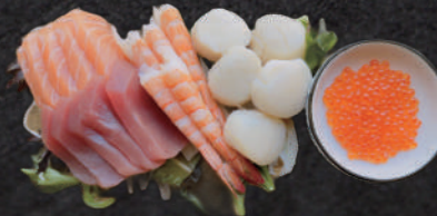
32 Sashimi de luxe 20stk 260,- ( laks, tun, reje, stegte kammusling , Ørredrogn )