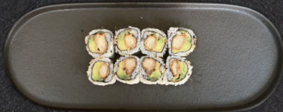
58 Kylling Rolls 75,- ( kylling , avocado, agurk, chili mayo , teriyaki, sesam )