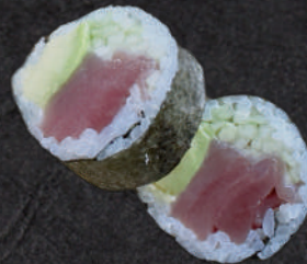
45 Big Spicy tun 65,- ( tun, avocado, agurk, tobiko, chili mayo, forårsløg)